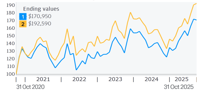
Quarterly rolling 12-month performance (%)